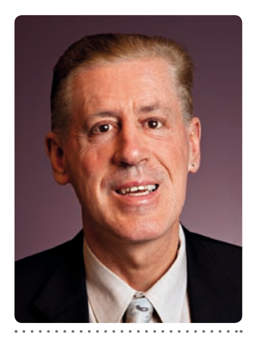
Graeme Innes AM Disability Discrimination Commissioner

I hope this guide improves your capacity as a manager or employer to manage OHS issues, treat all employees fairly and ensure safer and more productive workplaces for all Australians.